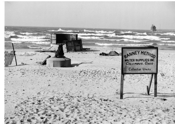
Pictured above is the City of Grand Haven's installation process of the retired 1950's Ranney Well Collectors (one of three). Designed to deliver 7 million gallons per day (MGD), but only could deliver 5 MGD. All three wells were removed in 2002.

Crockery Township is pleased to present this year's Drinking Water Quality Report. This report is designed to inform you about the quality of the water we deliver to you everyday. Our constant goal is to provide you with a safe and dependable supply of drinking water. We are committed to ensuring the quality of your drinking water.